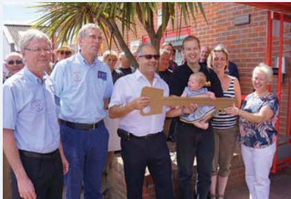
A family business.

ML&S gave away a free t-shirt noting their 25 years in business to the first 200 customers, with some turning up as early as 6.45am to ensure they got one. Representatives from Icom, Kenwood and Yaesu were on hand to demonstrate their equipment and provide technical advice to the visitors. Bargains galore were being grabbed by the crowd and people came from as far as Newcastle and even India to attend the event. The day was marked by clear skies and warm temperatures so the burgers, sausages-in-a-bun compliments of ML&S went down well.