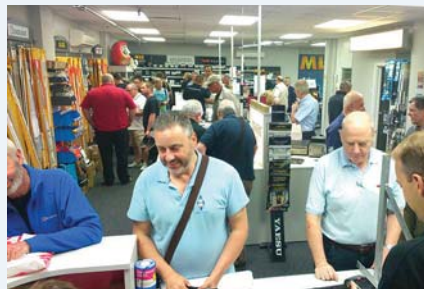
Bargain hunters in the new showroom.