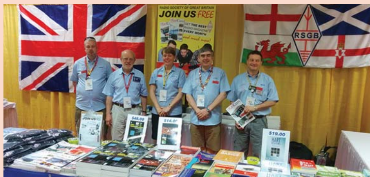
The RSGB team on the Dayton stand