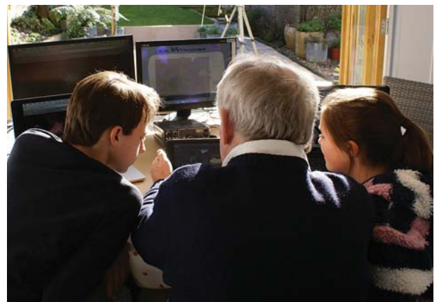
Norfolk Coast ARS has held a number of Teach-ins on various topics where members pool their total knowledge of a subject – the newer members being able to learn from the old hands in the club. Recent teach-ins have included earth current meters and common-mode currents in antenna feeders. The club has looked at the choke designs of G3TXQ and GM3SEK and the members made a number of chokes both for their own use and for further evaluation at the club station. When the school contacts with the ISS have taken place, NCARS has monitored the downlink and used the opportunity to evaluate various antenna designs. The contact with the Oasis Academy at Brightstowe took place in the Norfolk school half term and so the club secretary Steve, G3PND invited his grandchildren along. The downlink was monitored directly on two 2m receivers, one fed from a steerable Yagi and the other from a simple colinear. The contacts were also monitored through the live internet feed.